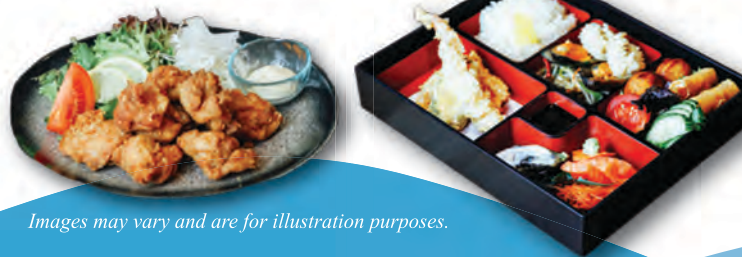
Images may vary and are for illustration purposes.