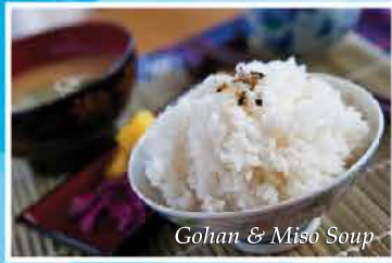
Gohan & Miso Soup